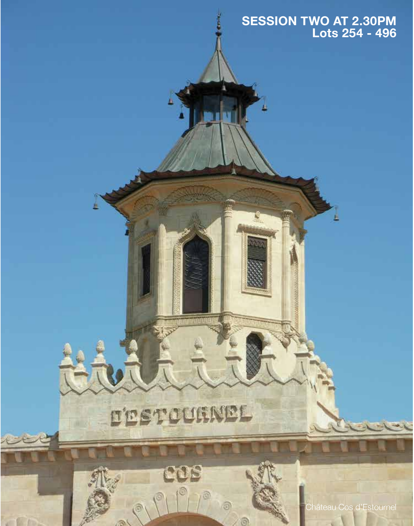
Château Cos d'Estournel