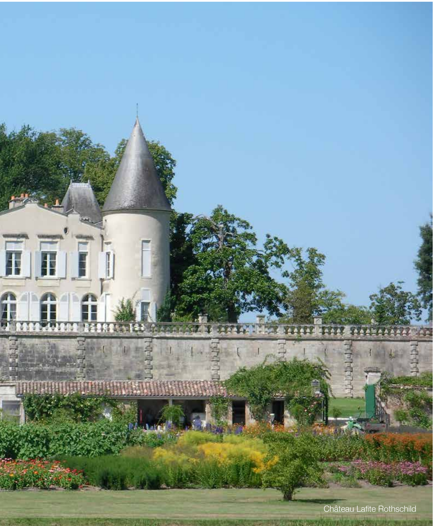
Château Lafite Rothschild